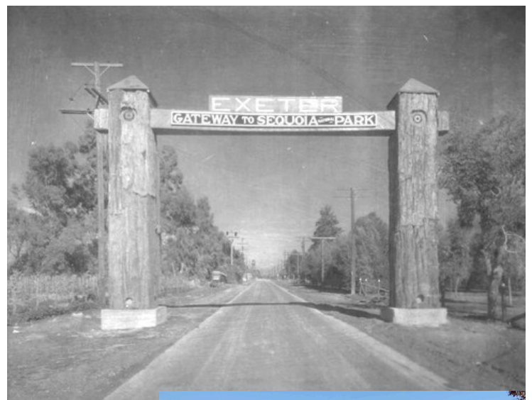
ABOVE: Original Gateway Arch, 1926. RIGHT: Exeter Kiwanis Gateway Arch on East Pine Street, December 2024.