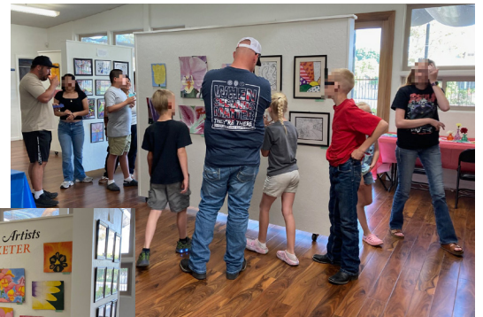
TOP & LEFT: Parents and students view artwork during the Future Artists of EXETER art reception at CACHE.