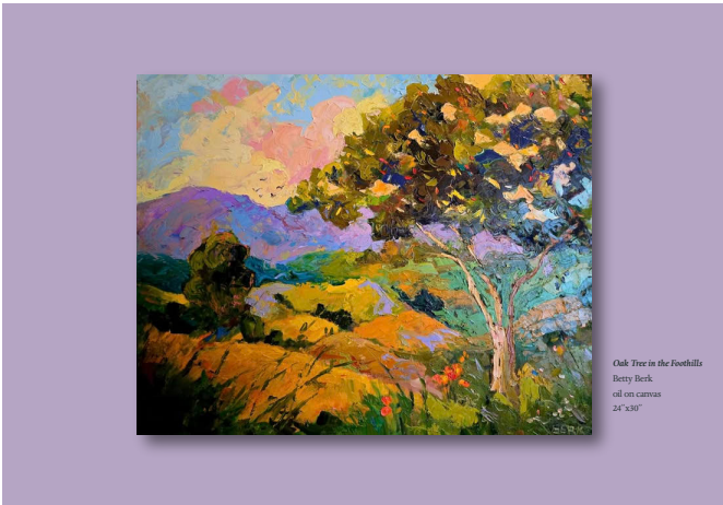
Oak Tree in the Foothills Betty Berk oil on canvas 24" x 30"