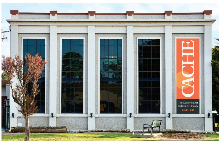
LEFT: A new banner to flank CACHE's historic Mt. Whitney Power wing, part of the rebrand for The Center for Art, Culture and History-Exeter.