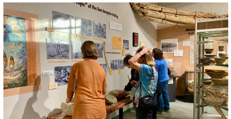
Top: Native American Basket Weaving Workshop. Bottom: Wukchumni Indian Presentation attendees interact with the hands-on station in our Yokuts exhibit.