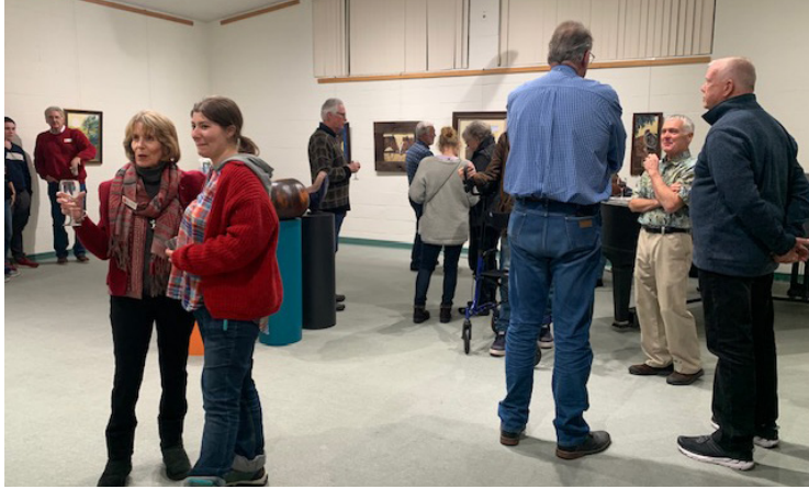
Reception attendees enjoyed the work of local watercolorists

CACHE hosted its first artist reception of the year for the exhibit, Watercolors: From Winter to Spring . The event was held on January 6th from 4 to 7 p.m. and welcomed over 70 local art enthusiasts.