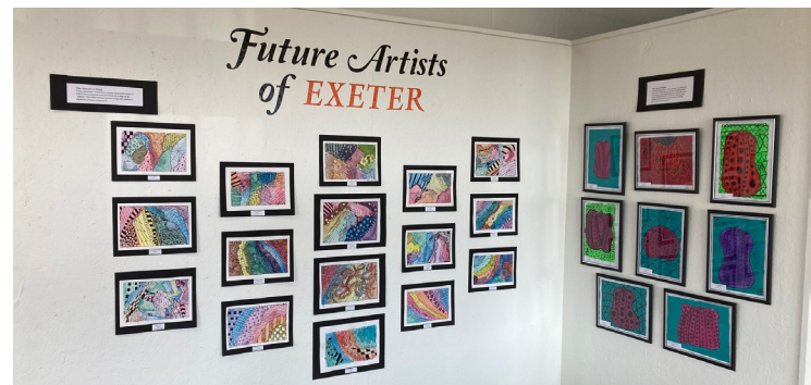
Wilson Middle School exhibits student art projects at CACHE.

The exhibit will be on view until Friday, February 27. Be sure to stop by and see it soon!