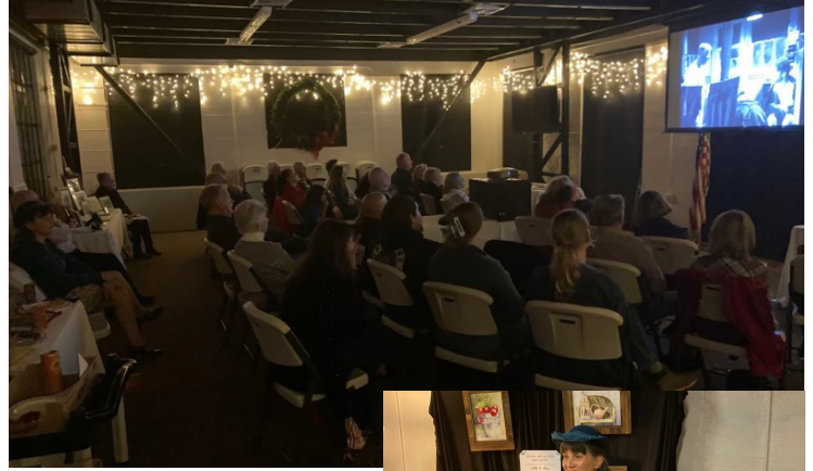
TOP: Attendees view the classic cinema season finale of It's a Wonderful Life .