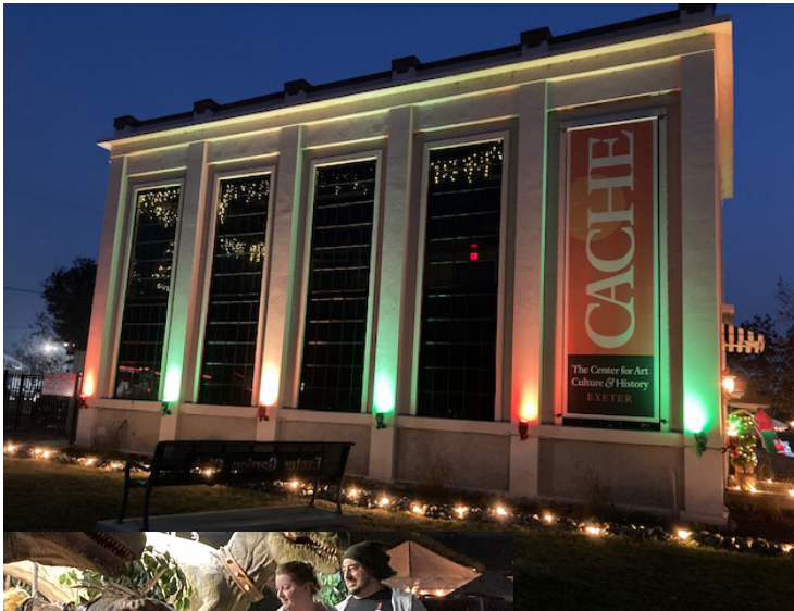
TOP: North side of CACHE building lit up for the holidays.