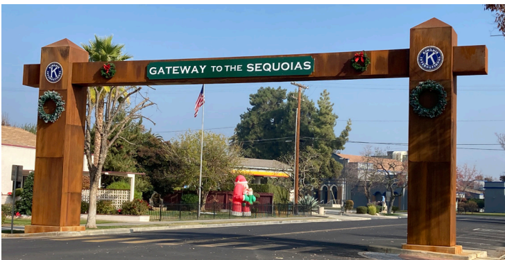
Exeter Kiwanis Gateway Arch on East Pine Street.

Fast forward to 2023, when Exeter Kiwanis leadership trailblazes the recreation of the Gateway Arch on East Pine Street to commemorate the 100th year of Kiwanis service in Exeter. The historic dedication is scheduled for Spring 2025. Additional information to follow.