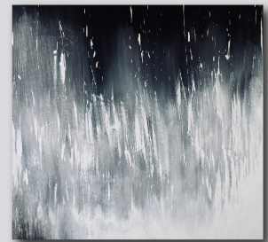
Untitled, Jordan Long, mixed media, 2022